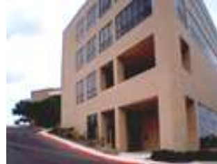
BUILDING # 6- CONF. CENTER ADDITION

Infrastructure & Network Services netVision20 (formerly STARTnet) Project SMART Head Start- Bexar County Meeting Rooms (Cedar, Cottonwood, Cypress, Elm). Catering/Lunch Room