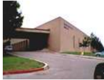
BUILDING # 1- MEDIA