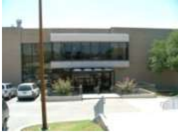
BUILDING # 4 -CONFERENCE CENTER