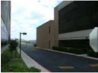
BUILDING # 2 (Entrance through Building 3)