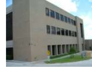
BUILDING # 3

Executive Director Administrative Services Administrative Support (PDAS, Assessments, ILD) Alternative Certification for Administrators (COLA) Digital Knowledge Central (DKC) Distance Learning Distance Learning Classroom Field Services Instructional Technology Leadership Development and Assessment Lunchroom Migrant Personnel Services Coop School Support State Initiatives Teacher Orientation & Preparation Program (TOPP) Title 1 Non-Public Co-op