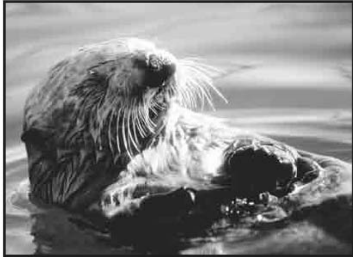
The sea otter eats clams by cracking the shells open against a stone.