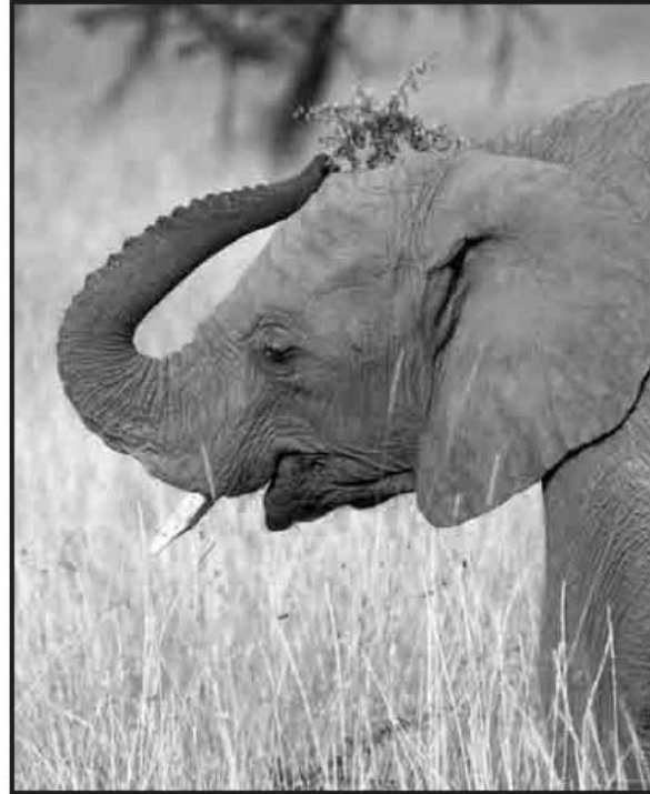
An elephant uses a stick or branch for scratching.

8 Chimpanzees have found an unusual way to stay clean. A chimpanzee makes a sponge out of leaves. The leaves are like paper towels and soak up water. The chimpanzee uses the damp leaves like a wet washcloth. It wipes off mud or sticky fruit juice from its body.